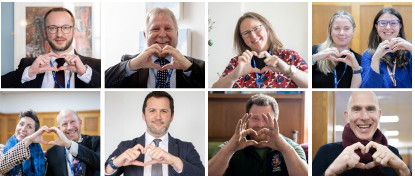
Collectively we can all #InspireInclusion - International Women's Day 2024

Elsewhere, the day has been marked with a show of solidarity and love with the #InspireInclusion pose being shared by pupils and staff across both sites. A reminder that when we value difference, inclusion comes from the heart.