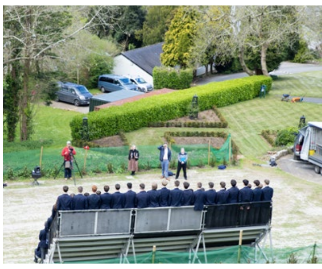
5th Year and Upper Sixth photos taking place on the Terrace