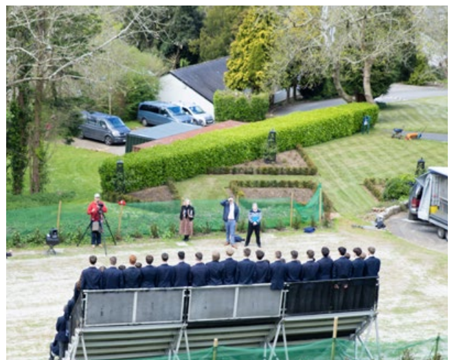
5th Year and Upper Sixth photos taking place on the Terrace