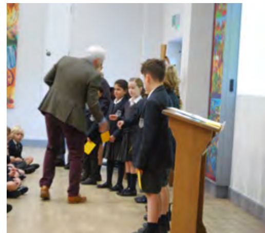
A few photos from Friday's Rewards Assembly